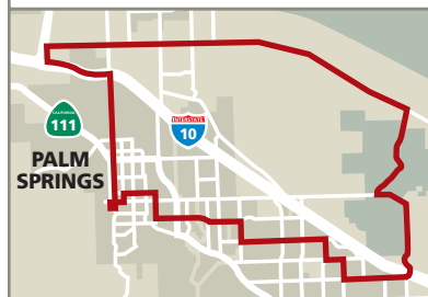
55-mile route, starts at 8 a.m.