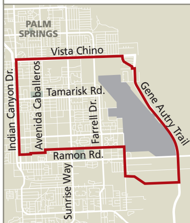
10-mile route, starts at 10:30 a.m.